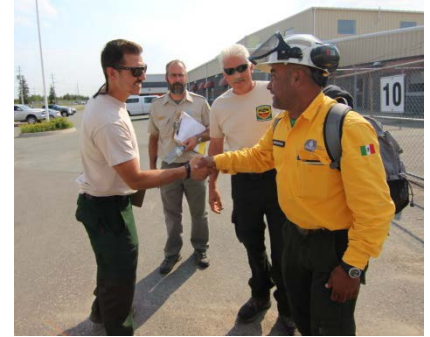
Fire personnel from Mexico arrive in Sudbury. (Above)

It seems that by being a sharing neighbour, we have in return, received support from far and wide. Our appreciation for the forest fire colleges that join us from across Canada, the United States, and as far away as Mexico, is heartfelt and will be remembered by Ontario for many years to come.