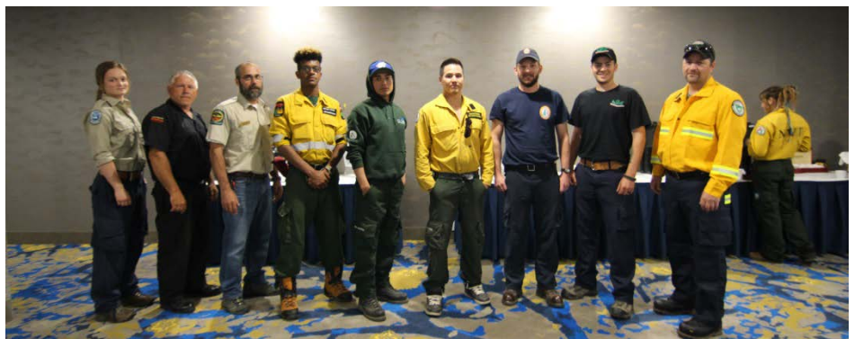
Fire personnel from across Canada are briefed in Sudbury. (Above)