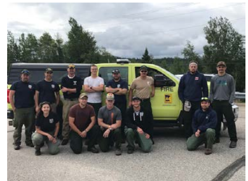
Fire personnel from Minnesota arrive in Dryden. (Above)