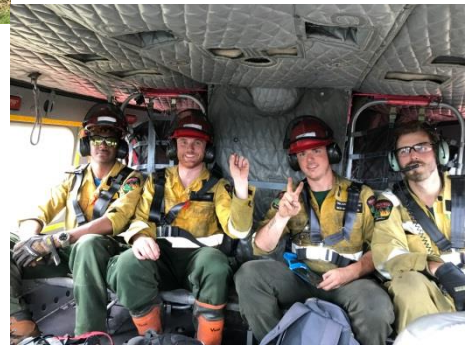
Right: crew flying to the fire