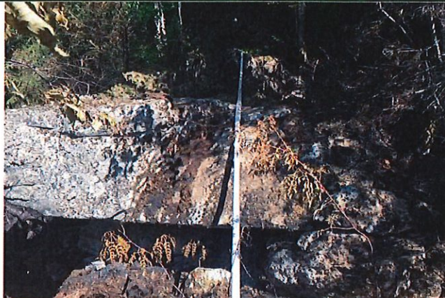
Firefighters are working hard to consolidate hose around the fire perimeters in steep rocky terrain.

The MNRF has been advised by the Municipality of Temagami that the Mandatory Evacuation Orders from Temagami Shores, at the south edge of the town of Temagami, to Jessie Lake including Bell Island on Lake Temagami have been downgraded to an Evacuation Alert. Residents may return home however, must remain on alert as they can be asked to leave again at any time based on the fire situation.