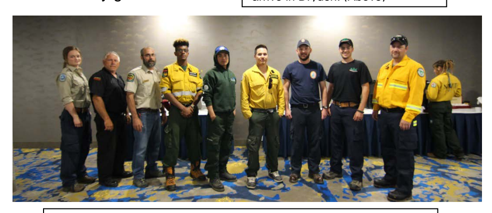
Fire personnel from across Canada are briefed in Sudbury. (Above)