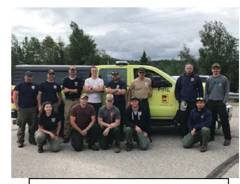
Fire personnel from Minnisota arrive in Dryden. (Above)

It seems that by being a sharing neighbour, we have in return, received support from far and wide. Our appreciation for the forest fire colleges that join us from across Canada, the United States, and as far away as Mexico, is heartfelt and will be remembered by Ontario for many years to come.