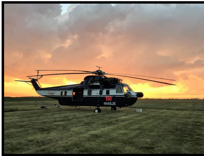
North Bay 72

If you have questions or concerns about smoke and your health, please contact TeleHealth Ontario at 1-866-797-0000.