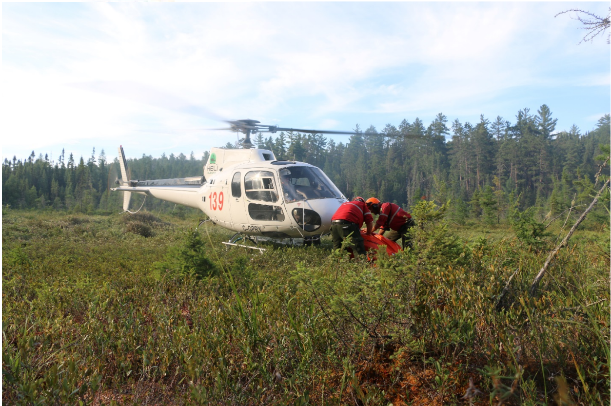
Firefighters attach heli-bucket, to give support to firefighters on the ground.

A mix of sun and cloud with a chance of thunder showers is expected for tomorrow afternoon. The temperatures will rise to 25C. Winds will be out of the northeast at 5 - 10km/h with a potential to change to a southerly direction come the afternoon. Relative humidity values are expected to be high into the 80% range.