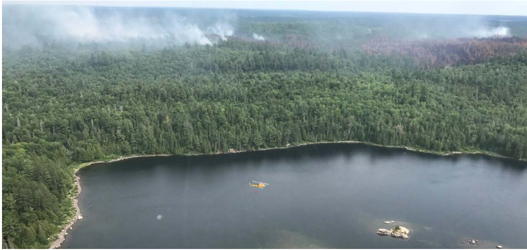
Above: Smoke in the background. Helicopter coming in over the lake to fill his bucket and head back to the smoke.