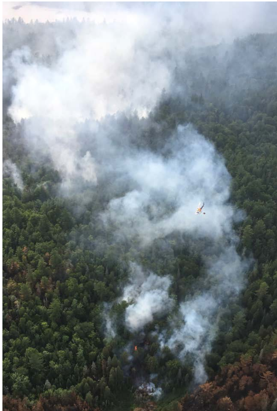
Left: Aerial view of fire 062. Look carefully and you can see the tree candling near bottom center, and the helicopter with bucket approaching from center right.