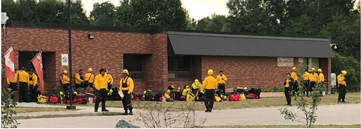
Above: Crews from Mexico are ready to deploy to the fireline. Below: Briefing, packing food, and familiarization with the helicopters.