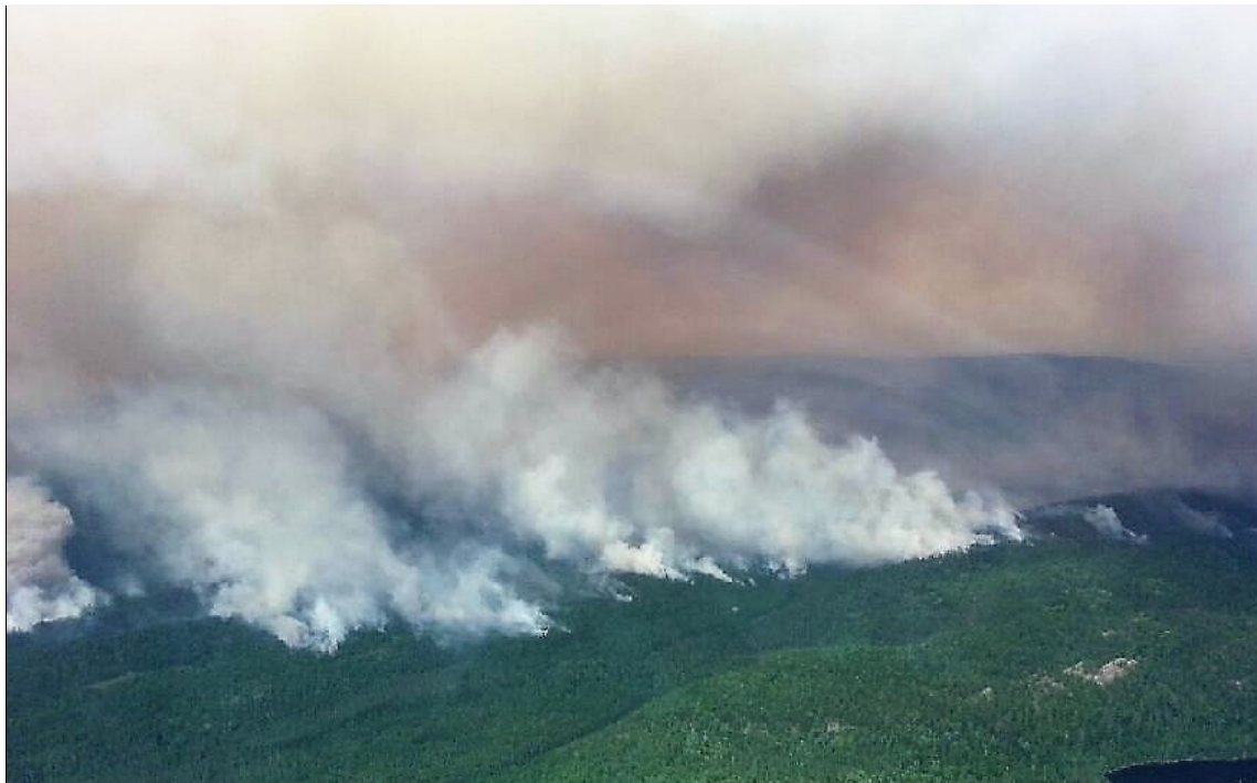
Extreme fire behaviour July 22

The Lady Evelyn Park cluster is managed by the Dale Horan Incident Management team from Ontario. 238 firefighters and support staff and 11 helicopters were assigned to North Bay 72. Four CL415 Waterbombers and two bird dogs were dispatched to assist with suppression efforts on North Bay 72. The team continues to observe North Bay 59.