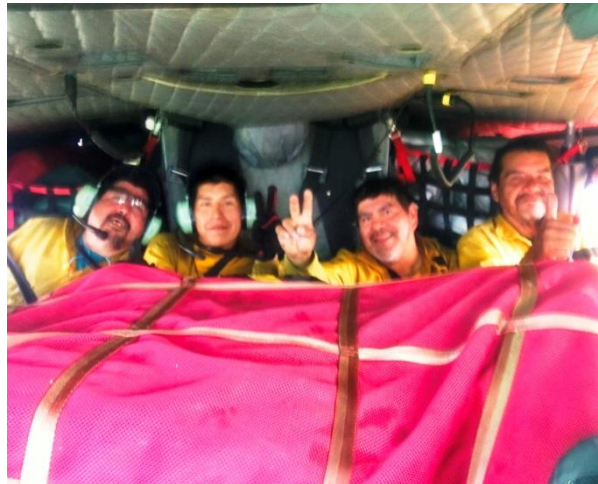
Fire Crew in Temagami heading to a fire.

If you have questions or concerns about smoke and your health, please contact TeleHealth Ontario at 1-866-797-0000