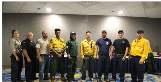
Forest Fire personnel from across Canada come together to assist with the forest fire situation in Ontario.

Additional resources are expected in the coming days from North West Territories, Nova Scotia, Newfoundland, Saskatchewan and Alberta.