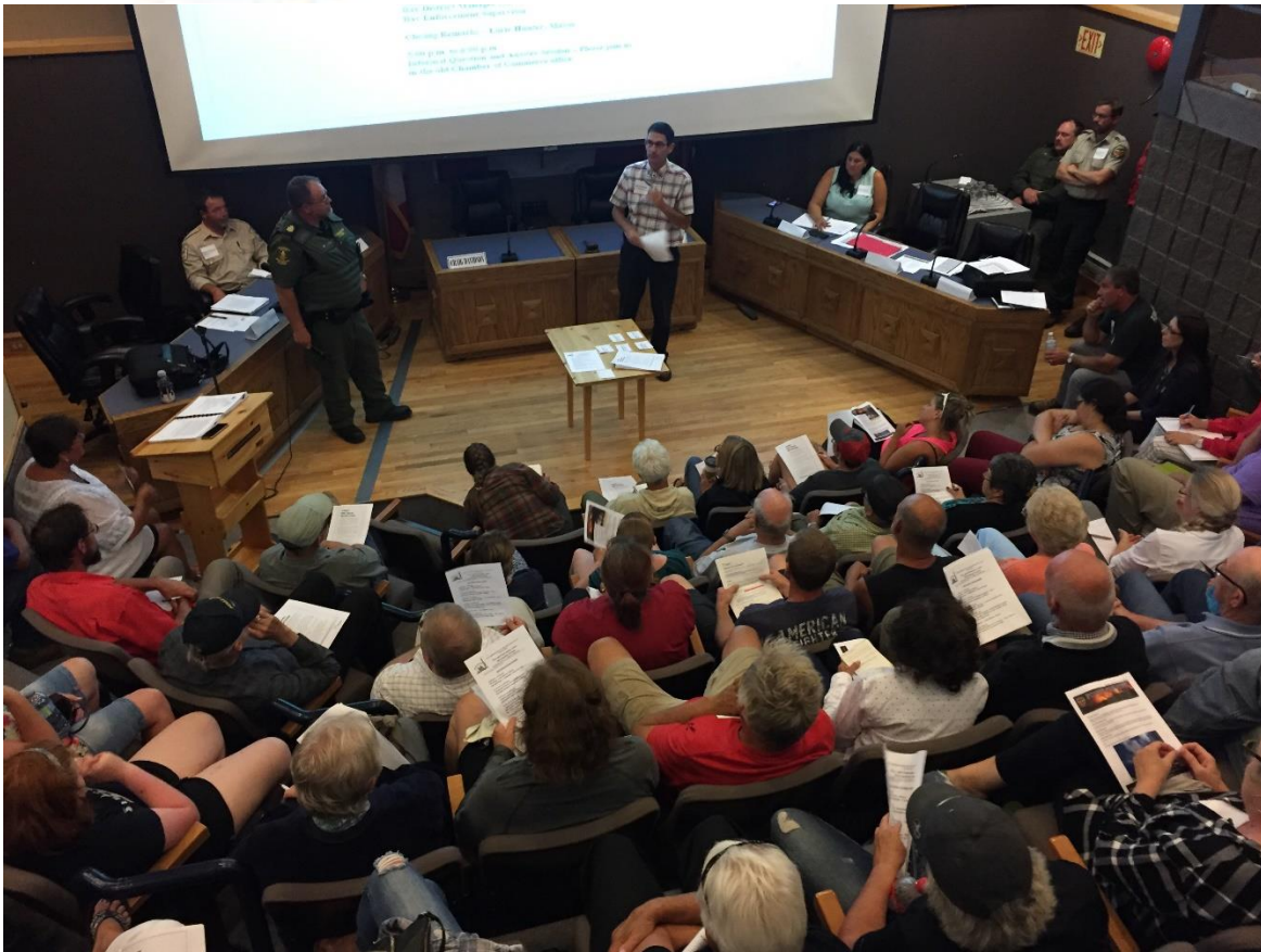
Picture of the information session hosted by the Municipality of Temagami today

Sunny skies are expected in the area tomorrow. As temperatures rise into the high 25C range winds will be light to moderate out of the southwest at 12km/h. Relative humidity values are expected to be at the 43% range over much of the Northeast Region.