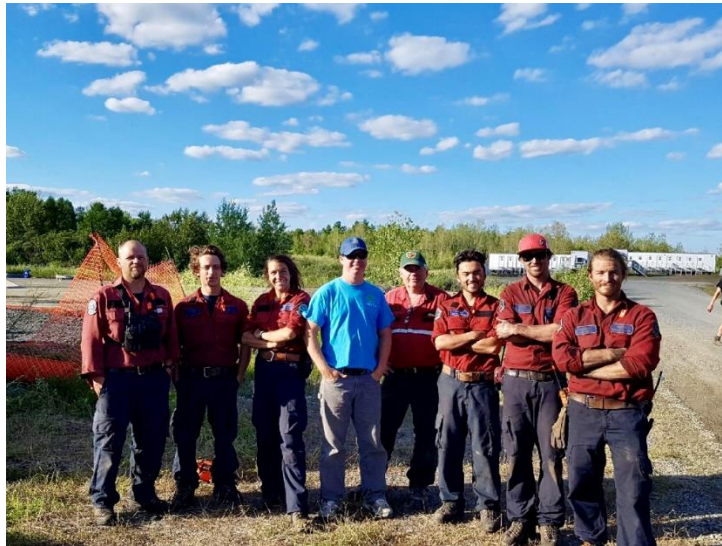
Fire Crews in Temagami

If you have questions or concerns about smoke and your health, please contact TeleHealth Ontario at 1-866-797-0000